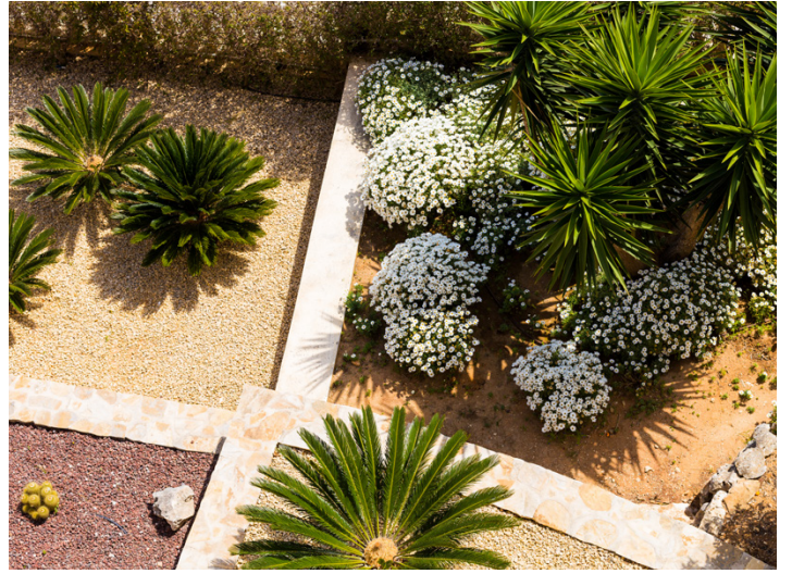
A drought-tolerant garden.

Customers interested in learning more about current and completed infrastructure projects in their service areas are encouraged to visit their service area's webpage at www.gswater.com.