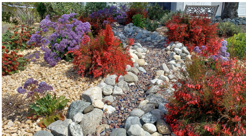
A drought-tolerant garden.