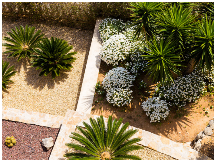
A drought-tolerant garden.

Customers interested in learning more about current and completed infrastructure projects in their service areas are encouraged to visit their service area's webpage at www.gswater.com .